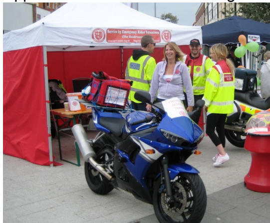
The SERV-Essex team.